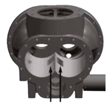
BYPASS PORTS IN STATOR Rotors removed to show Bypass Ports